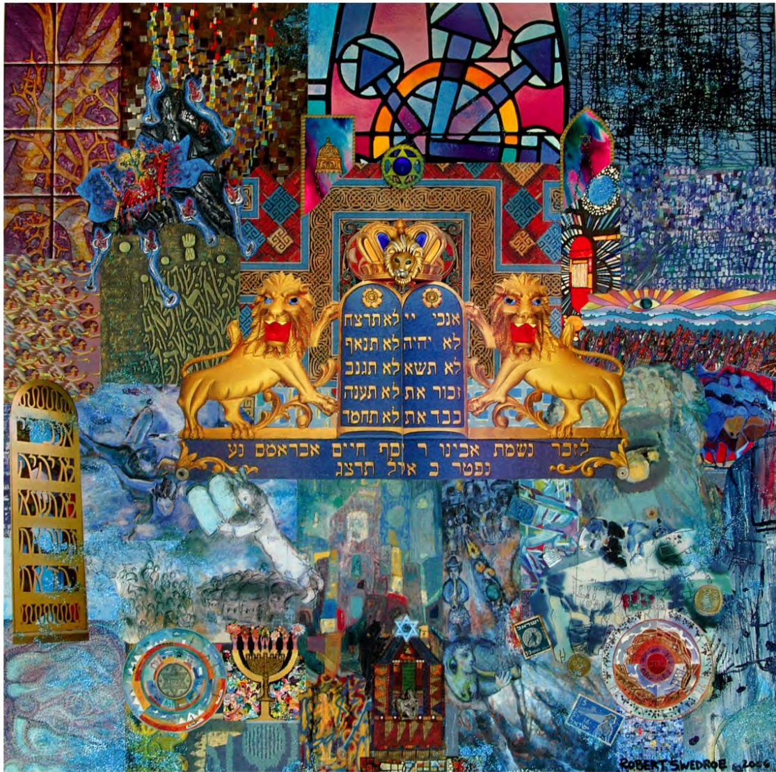
Emounah (rules to live by)