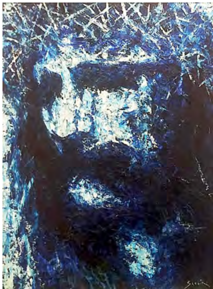
Bottom Left: Christ in Blue , 1992 Oil on canvas 24 in. x 18 in