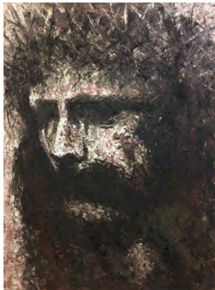
Bottom Right: The One , 1992 Oil on canvas 24 in. x 18 in