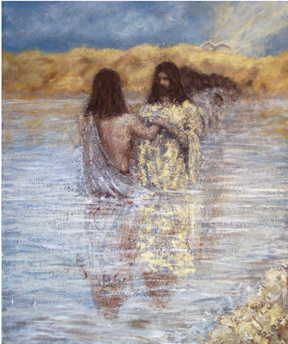
Baptism of Christ