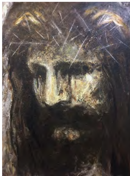
Top Right: Christ Thorn , 1993 Acrylic on canvas 40 in. x 30 in.