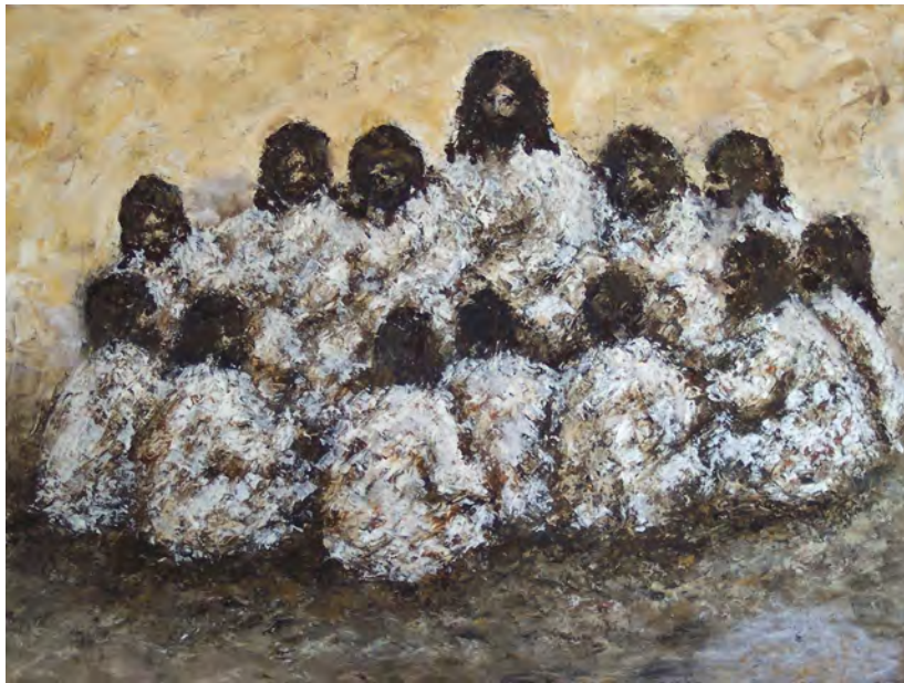
More Will be Revealed