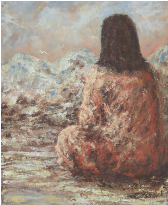
Cristo de Espalda