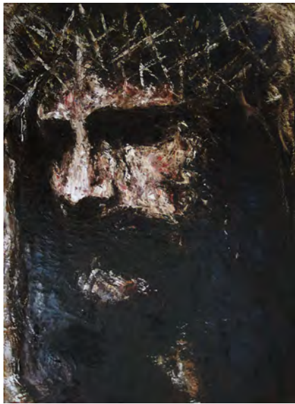
Top Left: Christ , 1993 Oil on canvas 24 in. x 30 in.