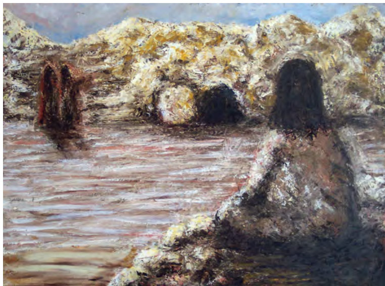
Don't Look for the Living among the Dead